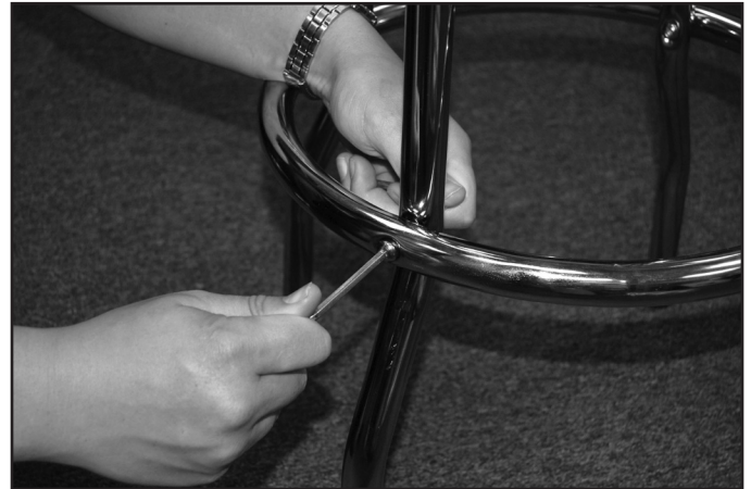
Step 2: Slide the ring over the legs and align the holes on the ring with the holes on the legs. Slide the sleeved, allen head screw into the hole and an allen head screw through the other side and tighten down using the supplied allen wrenches. Repeat for the other holes.