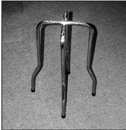
Step 1: Place the two legs together as shown in the image above.