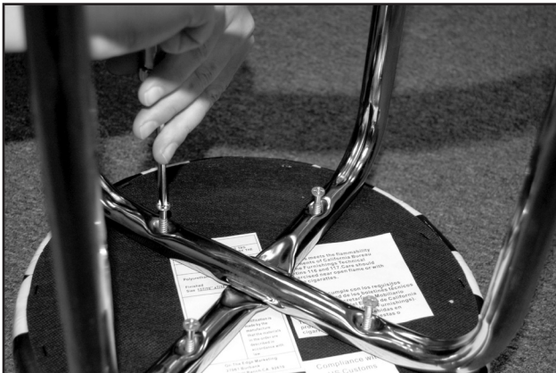
Step 3: Place the seat pad on a flat stable surface with the underside facing up. Turn the assembled legs and place it on the underside of the seat pad. Align the holes in the legs with the holes in the seat pad base. Using the supplied self-tapping screws secure the seat pad to the legs.